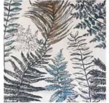
Plantation Sky-P.E GR58