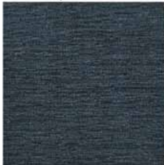
Restore Navy-P.E GR43