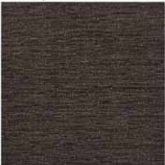
Restore Espresso-P.E GR43