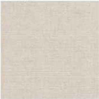
Reclaim Ivory-P.E GR43