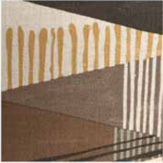
Cheerful Sky-P.E GR58