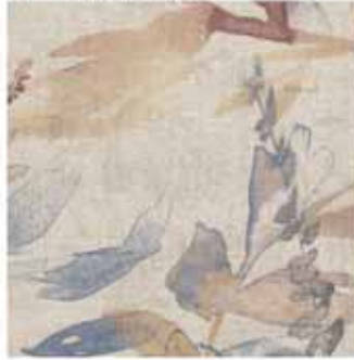
Friendly Tangerine-P.E GR53