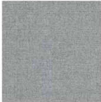
Reclaim Sky-P.E GR43