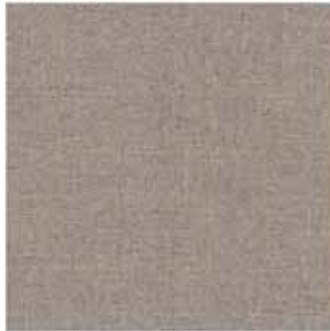
Reclaim Sand-P.E GR43