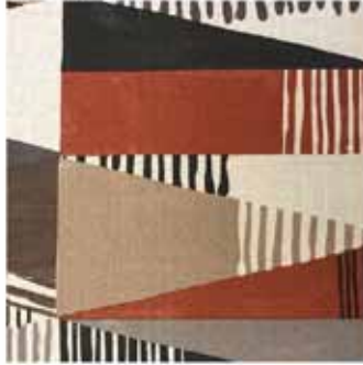
Cheerful Tangerine-P.E GR58