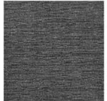
Restore Charcoal-P.E GR43